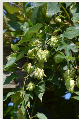
Hops Humulus lupulus