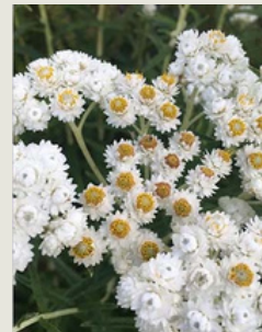
Pearly Everlasting Anaphalis margaritacea