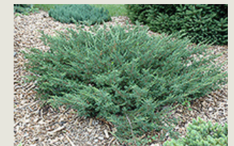
Ground Juniper Juniperus communis