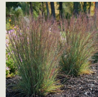
Little Bluestem Schizachyrium scoparium